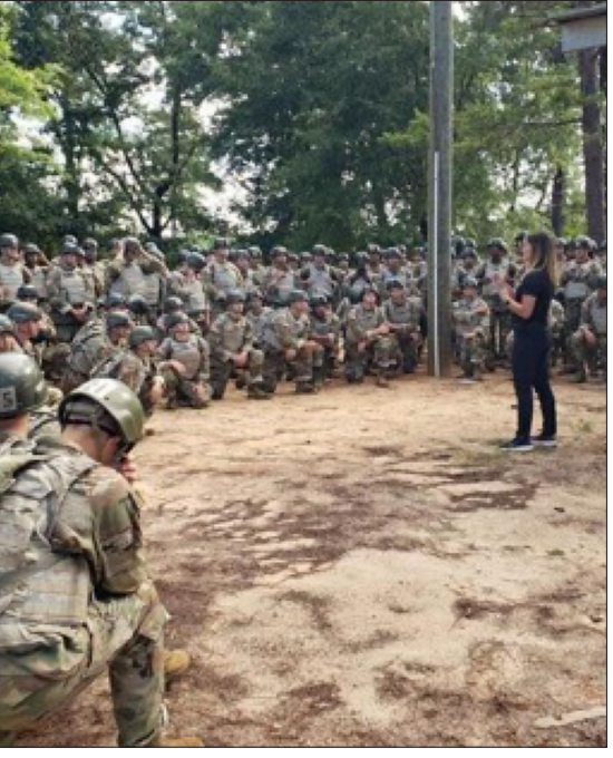
Relationship Building Through Communication FORT BENNING, Ga. – MRT-PEs taught Soldiers how to optimize performances at the range and provided communication skills to strengthen one's relationships, create boundaries, and set expectations.