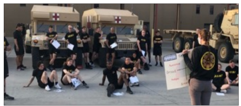
An EPE works with Soldiers.

Successful EPEs determine who the advocates are, as EPEs often need one person per platoon with whom they work directly and who will help spread the word about their capabilities. These EPEs can also market themselves by displaying visuals (e.g., physical advertisements) on the walls or bulletin boards with permission. In addition, they use social media (e.g., Facebook, Instagram, Twitter) to share the work they are doing in the unit. These EPEs provide support in various ways, including academic performance training or mastery sessions for weight loss or smoking cessation. EPEs also create materials (e.g., flashcards, laminated resources) to